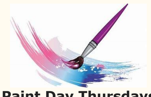
Paint Day Thursdays

Paint Day, open to both members and non-members, is held every Thursday at Ascension Lutheran Church, lower level, between 9:00 a.m. and 2:00 p.m. Parking is available on the north side of the church. A donation of $1 per session is requested to help cover costs. Contact Kathy Reitz at kmr68@q.com for more information.