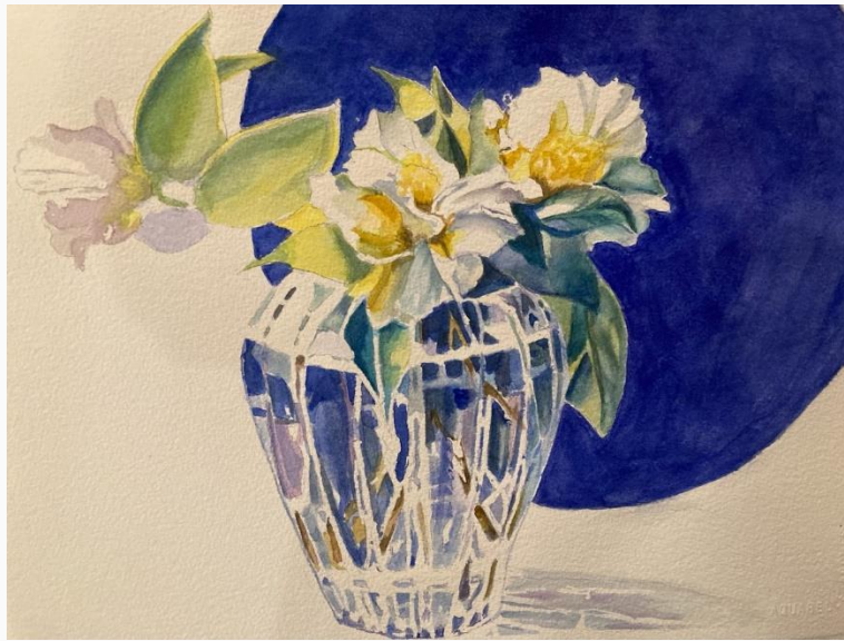
Azul by Kim Gedeon

In case you missed the Healing Arts Show during its run at the Castlerock Adventist Hospital, it is moving to the Littleton Adventist Hospital. It opens for a 3-month run starting April 1, 2021. A number of the paintings are new since the show first opened so stop by for a visit if you are in the area. The gallery is just to the left after you go into the main entrance. You can also see the paintings on our website at https://www.heritage-guild.com/2021-healing-arts-show-selected-artwork.html . All artwork is for sale.