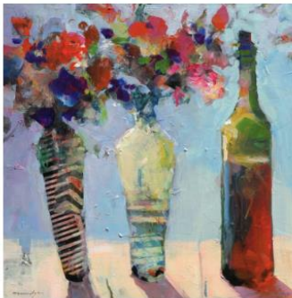
Foggy Morning by Bob Burrige

Use paper collage and acrylic paint to add depth to your paintings.