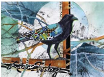
Live Today by Karen Knutson

Use water soluble media to create paintings in your own style- from realism to abstraction.