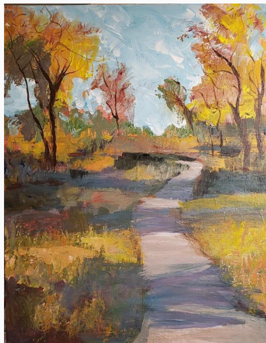
1st Place Anticipation by Patty Cook