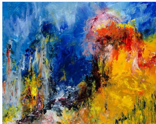
3rd Place Cameron Fire Blue by Bon Stälin.