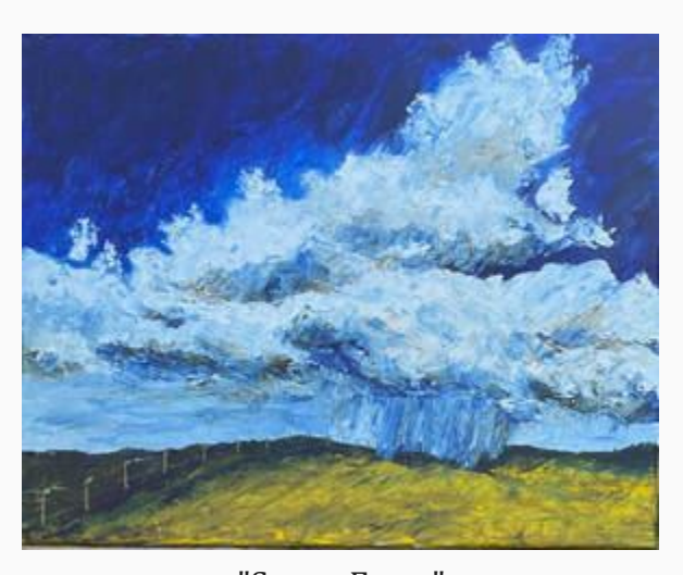
"Storm Front" 16x20 Acrylic by Janet Ford