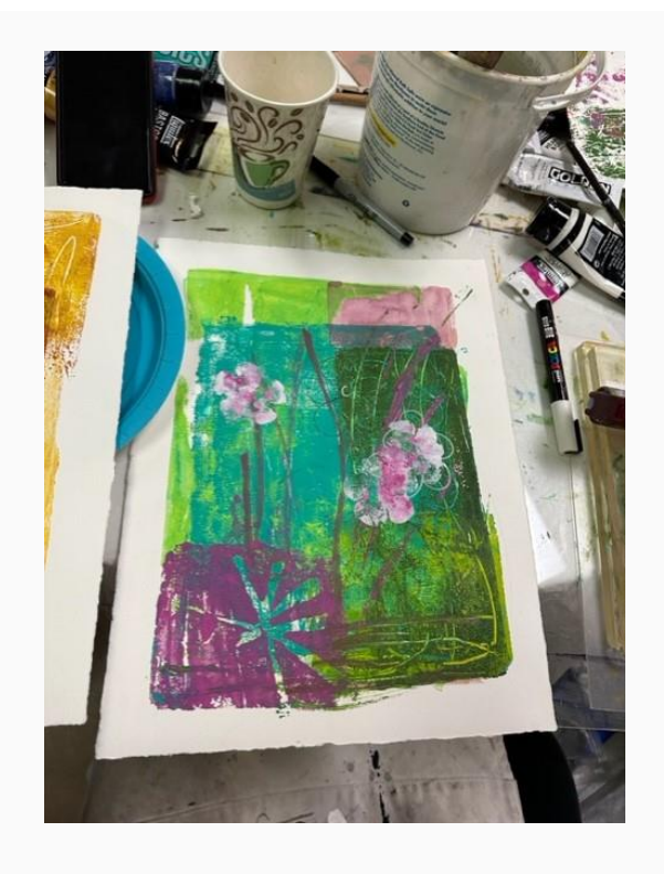
Alanna Austin - "Gelli Plate Printmaking"