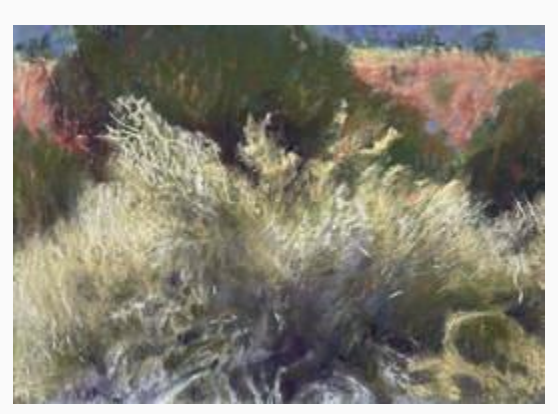
"The Chamisa Unfurls" 14x20 Pastel by Jane Shoenfeld The only prerequisite Is your interest in color and a personal connection to nature.

Simplification of color choices in response to harmonies on the color wheel is the focus of this two-day workshop. Working with these colors will help students create vibrant pastel paintings on a variety of surfaces. The class will also look at color in terms of saturation,