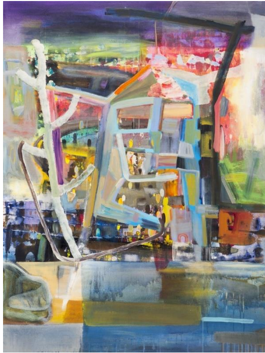
Purple by Homare Ikeda

Brush is an extension of your finger. A twig, a piece of cardboard or something other than brush might be a good tool for your painting. This workshop is designed to give artists a new look at tools and skills. Students will be working with the unconventional tool to be free from your expectation. Being in outside of your norm, you will discover a hidden talent that might help your painting style. The workshop is not much to do with how to paint, its emphasis on exploration.