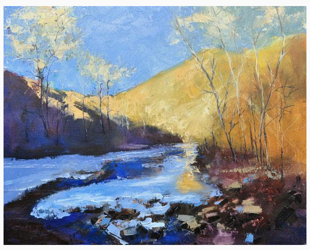
Cliff Austin - "Landscape Painting in Oils from Photographs" Saturday, November 5, 2022, 9am - 3 pm

Learn how to paint landscapes with oils in the Alla Prima style. Techniques for approaching landscape painting will be explored. Workshops will be structured around the drawing, painting and development of expressive techniques of landscape art.