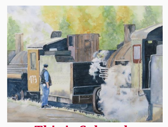
This is Colorado September 27-October 28, 2022