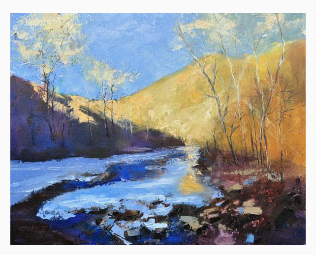
Cliff Austin - "Landscape Painting in Oils from Photographs" Saturday, November 5, 2022, 9am - 3 pm

Learn how to paint landscapes with oils in the Alla Prima style. Techniques for approaching landscape painting will be explored. Workshops will be structured around the drawing, painting and development of expressive techniques of landscape art.