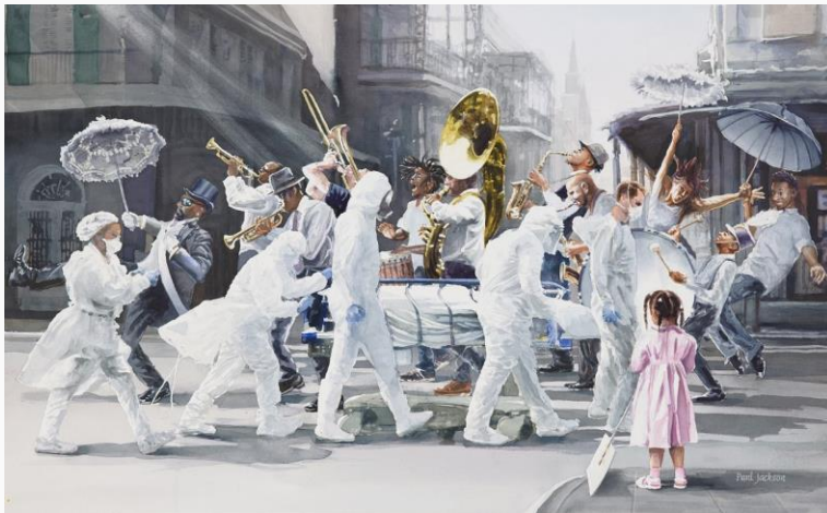
"Lost in The Moment" Watercolor by Paul Jackson