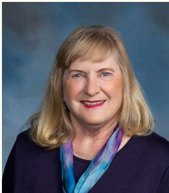
President's Message April 2024