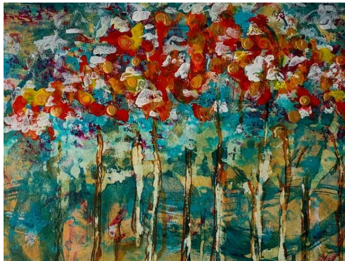
"Golden Apple Orchard" by Sheryl Hutchings

Congratulations to all of those selected for the show!