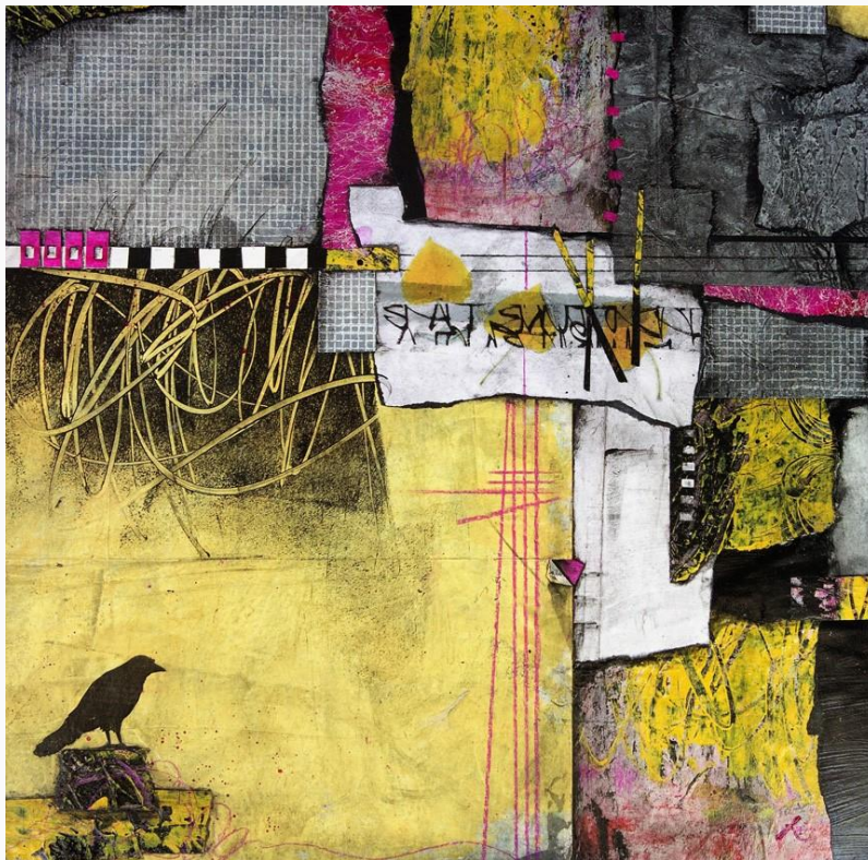
Cottonwood Candy by Laura Lein-Svencner

Student will end up with a 12 x 12 collage ready to mat and frame.