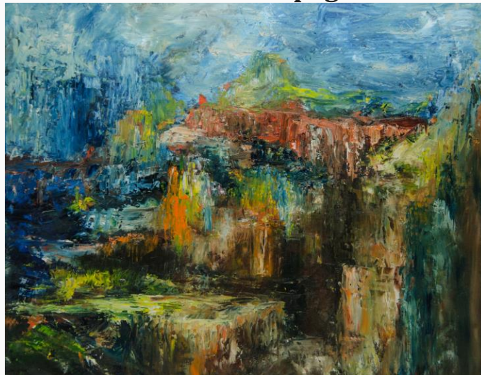
"Big Blue Grand" by Bon Stahlin