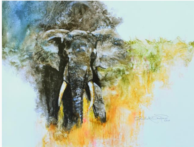
"Pride Of Africa" by Chuck Danforth