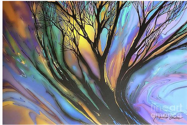
Tree in Moonlight by Jacqueline Shuler