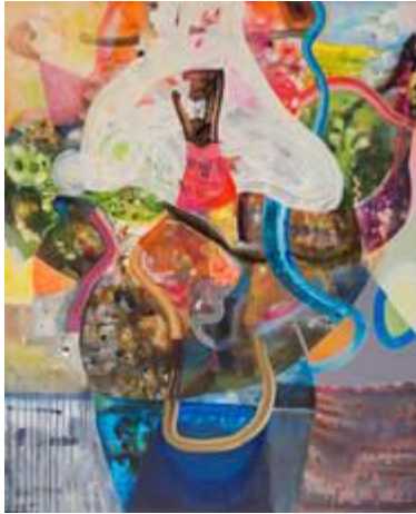
"Haika-Brown" by Homare Ikeda

Brush is an extension of your finger. A twig, a piece of cardboard or something other than brush might be a good tool for your painting. This workshop is designed to give artists a new look at tools and skills. Students will be working with the unconventional tool to be free from your expectation. Being in outside of your norm, you will discover a hidden talent that might help your painting style. The workshop is not much to do with how to paint, its emphasis on exploration.