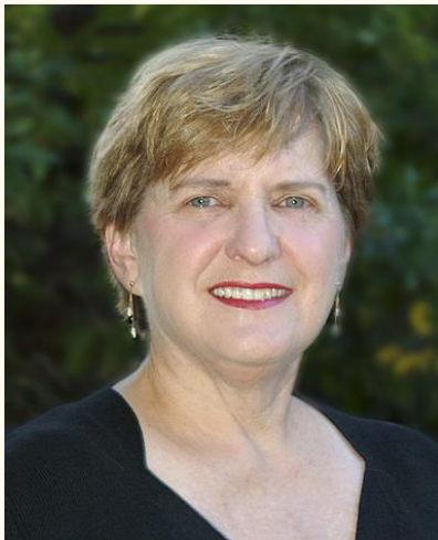
President's Message May 2023