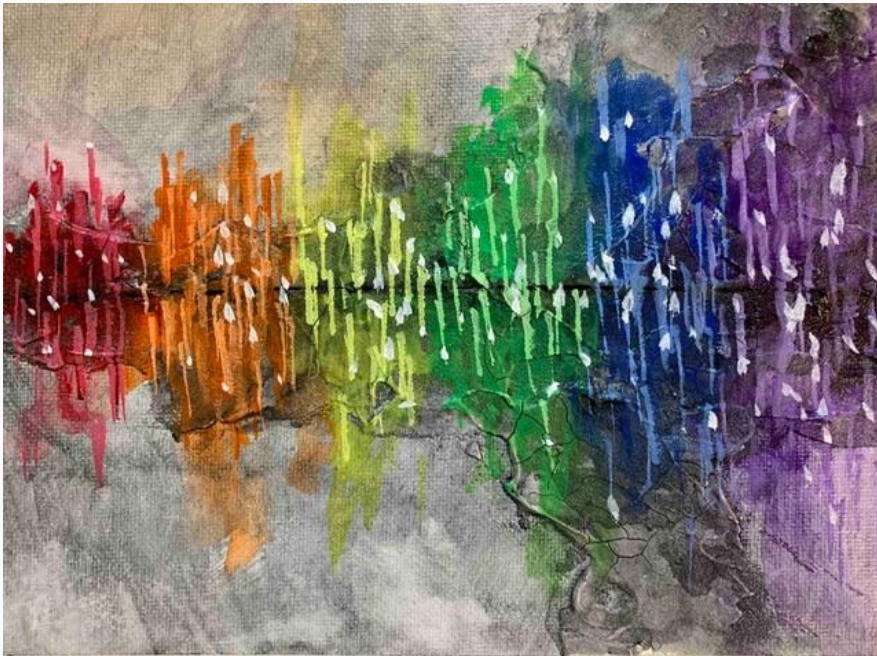
Plein Air Workshop with Pam Hostetler August 22, 2020