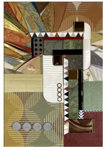
"Building Upon Diversity" by Aicha Jacol